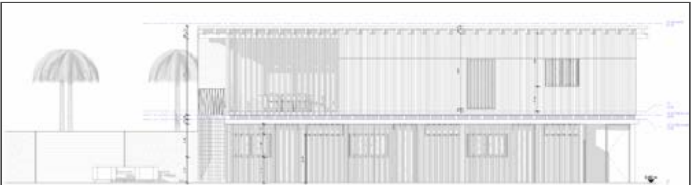
Links N VO 1:50