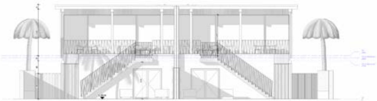
Achter N VO 1:50